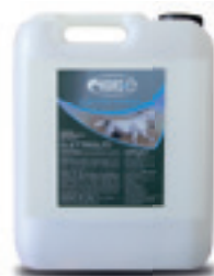
Product size Dosing Bottle 1 Kg Tank 10 Kg