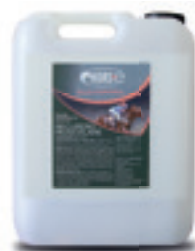
Product size Dosing Bottle 1 Kg Tank 10 Kg