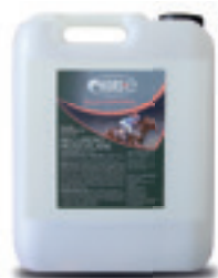
Product size Dosing Bottle 1 Kg Tank 10 Kg