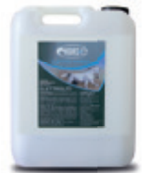
Product size Dosing Bottle 1 Kg Tank 10 Kg